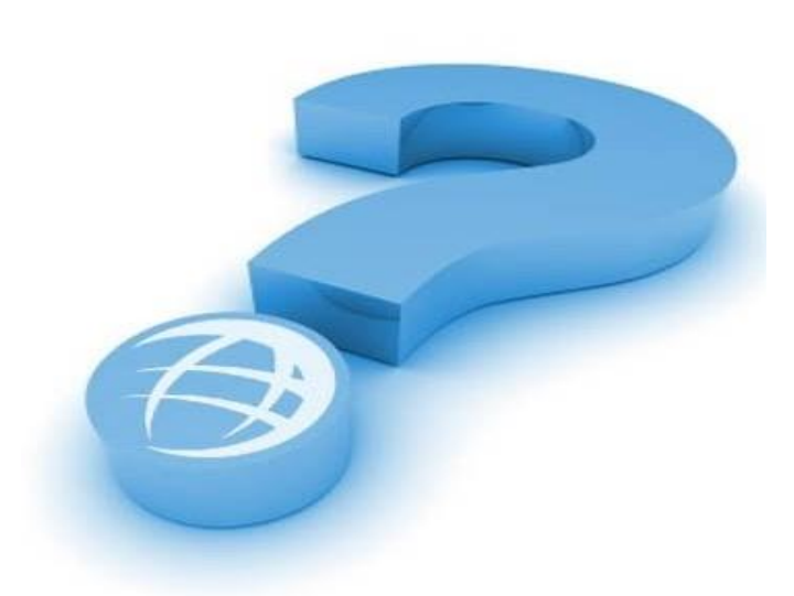
Step 3: The query is then

Step 2: Election Commission of India's Facebook page unravel what is the query and check how it can be resolved.